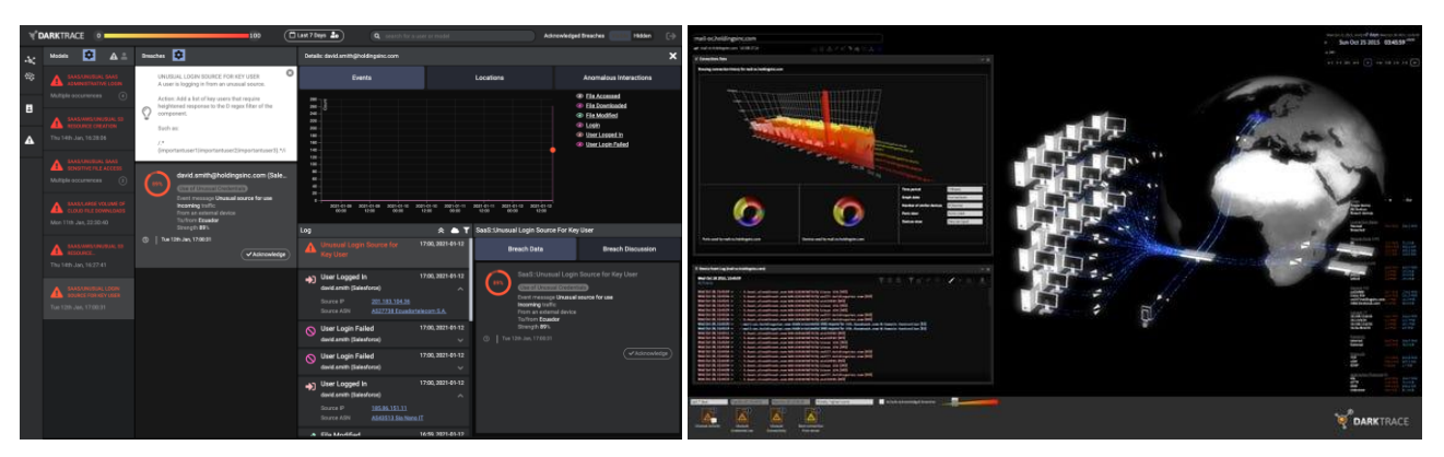
Darktrace Self-Learning Cyber Intelligence Platform

Darktrace is a global leader in cyber security technology based in Cambridge, UK. It provides enterprise-wide cyber defence protecting the cloud, email, Internet of things (IoT), traditional networks, endpoints and industrial systems. Darktrace uses self-learning artificial intelligence (AI) technology, which means that rather than using existing data to prevent a threat, it is learning 'on the job' from real-time data. Applied to cyber security, self-learning AI can identify and stop zero-day attacks, because it's not learning from historical attack data. To cope with fast-moving attacks, Darktrace technology also enables autonomous decision-making in order to react and take appropriate action on its own so it can immediately contain the threat and stop any possible spreading.