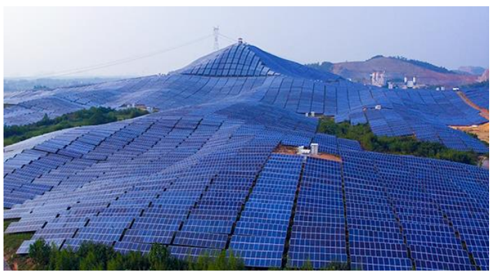
Xinyi Solar photovoltaic power station

Stock shown for illustrative purposes only and should not be considered as advice or a recommendation