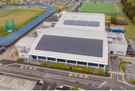
Ameresco designs and builds energy savings projects such as solar panels implantation over car parks or warehouse center

Stock shown for illustrative purposes only and should not be considered as advice or a recommendation