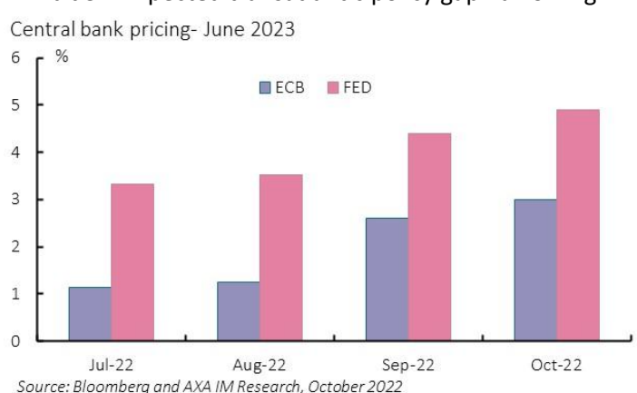
Exhibit 3 – Expected transatlantic policy gap narrowing

In general, in the face of upward surprises on inflation and hawkish signals from the central bank we recognize that our own call – that indeed the ECB would be "stopped out" at 2% - is at risk. The direction of travel at this stage is that the ECB will go further relatively quickly. 3%, the market pricing, still looks quite high in our view given the tightening in overall financial conditions in the Euro area – we highlighted last week that the "refinancing gap" for corporates is the widest since the Great Financial Crisis of 2008-2009 – but going to 2.5% looks increasingly likely. It seems that two forces – on top of a decidedly uncooperative dataflow – are fuelling the ECB's hawkishness. First, fiscal policy. The decision by Berlin to unleash another significant stimulus to shield its economy against the persistently high cost of energy – while it may dampen inflation in the next few months – can convince the central bank that it needs to do more on its side to "dampen demand". Second, we think the Federal Reserve (Fed)'s "gravitational pull" continues to exert a significant influence over the ECB, given the risk of allowing another depreciation of the euro, now that Janet Yellen has made it clear at the IMF annual meetings that the US was not in the mood of trying to curb the dollar. We can see the market expecting a narrowing of the gap between US and Euro area policy rates, from more than 200bps in July to c.150bps today (see Exhibit 3).